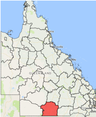
Figure 4 Estimated resident population by age and sex, Paroo (S) LGA and Queensland, 30 June 2015p