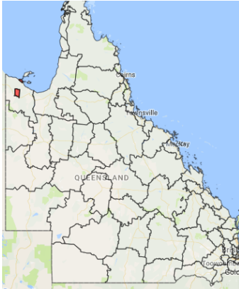
Figure 4 Estimated resident population by age and sex, Doomadgee (S) LGA and Queensland, 30 June 2015p